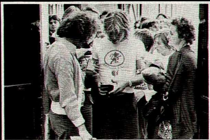
Checking In . . . Millwall supporters show their identification cards before being allowed on the train at Halifax.

The scheme applies for tomorrow's League Cup trip to Swindon, when coaches provide the transport.